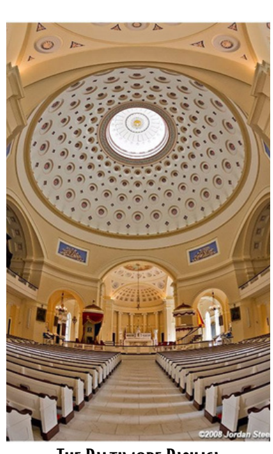
THE BALTIMORE BASILICA