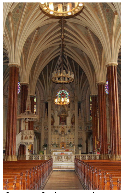
SHRINE OF ST. ALPHONSUS LIGUORI