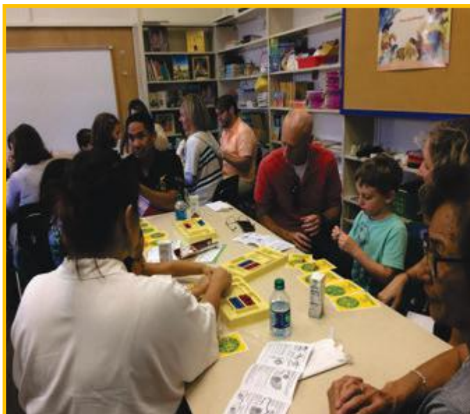
PREP families enjoying time together making Rosary Beads just in time for the month of the Holy Rosary

Join the children of our parish October 7 or 8 in praying the Living Rosary in our church courtyard. Sunday's recitation will take place at 10:15AM and Monday's recitation will be at 5:00PM. Come support the children in their prayers!